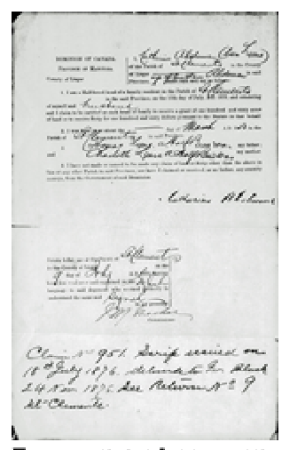
EXAMPLES OF AFFIDAVITS

The federal Department of the Interior presided over and kept records of the process of Manitoba Act grants. These records, including the original Affidavits used for Section 31 grants, still exist today and are held by Library and Archives Canada, Ottawa. The Affidavits were microfilmed by the National Archives.